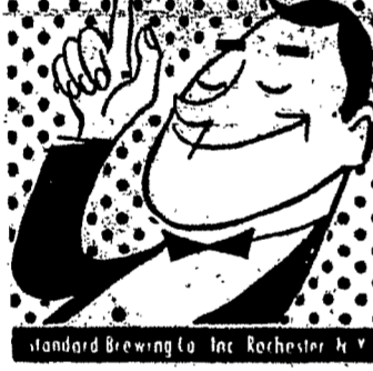
Standard Brewing Co. Inc. Rochester, N.Y.