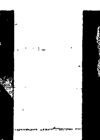
Daniel J. O'Mara Judge, Supreme Court

VOTE ROW A — All the Way — NOV. 8 VOTE FOR THE PARTY OF PROGRESS