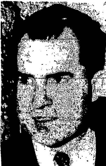
VICE PRESIDENT NIXON

Washington — (NC) — "Religion is not yet a controlling force in world affairs" despite the "revival of faith everywhere," Vice President Richard M. Nixon declared here. In an address opening the Second National Conference on Spiritual Foundations, Mr. Nixon said that "somehow, religious faith is not having sufficient impact on man's political life."