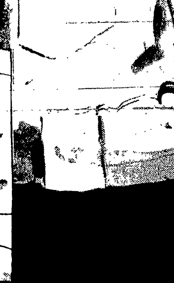
1. Dart: medium-point, corduroy stitched collar. In broadcloth... 3.95