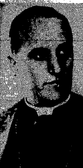
ARCHBISHOP STEPINAC Rome for he would not ask President Tito for an exit visa, fearing that he might not be allowed to return to his native country.

Vienna — (NC) — The silver jubilee as a priest of His Eminence Aloisius Cardinal Stepinac, Archbishop of Zagreb, a victim of communist "justice," passed without observance. Imprisoned by the Tito government for five years after a false trial, and restricted at Krasic, his native village, for the last four years, the Yugoslav prelate has been unable to exercise the duties of his office for the past nine years. The Cardinal is suffering from a blood disease, but otherwise his health is considered relatively good. He is permitted to take daily walks near his residence. He regularly offers Sunday Mass and hears confessions daily in the small parish Church at Krasic. He was ordained October 26, 1930, and received degrees in theology and philosophy from the Gregorian University in Rome.