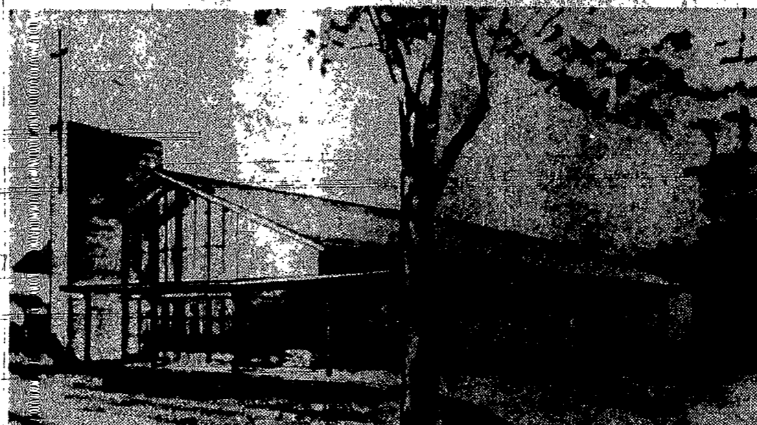
PLANS FOR THE CHURCH of St. Plus X in Chili call for a brick facade with the center portion made up of a large window area. A stainless steel cross surmounts the spire. The canopy extending along the driveway approaching the doors, provides protection from the elements. Martin, McGraw and Ward are architects for the church to be built at 3000 Chili Ave.