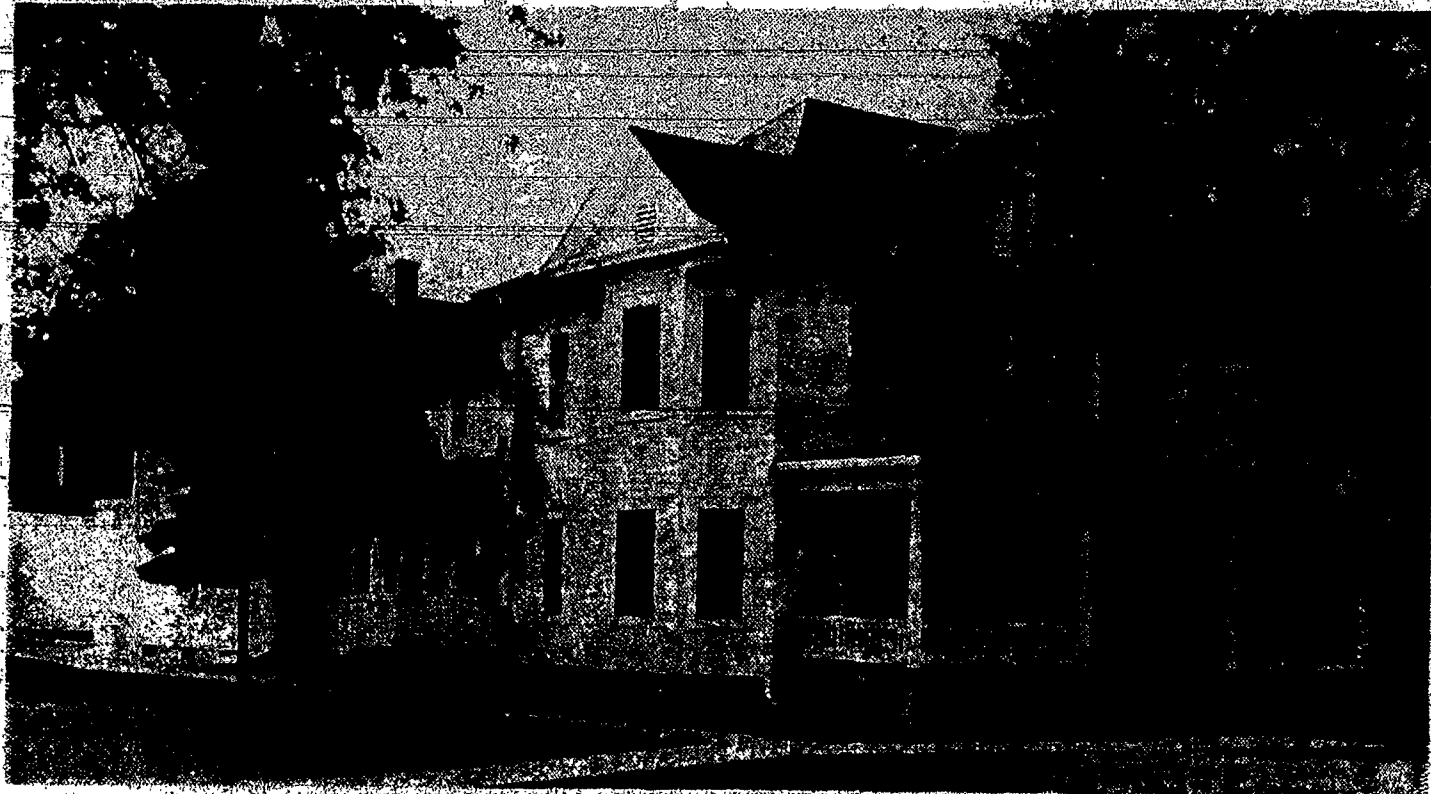
Notre Dame Convent—Residence For High School Sisters

The Sisters moved into the Notre Dame Convent on August 20 and in the incredible space of three days had the convent so well scrubbed, polished and settled that it seemed as though they had always lived there.