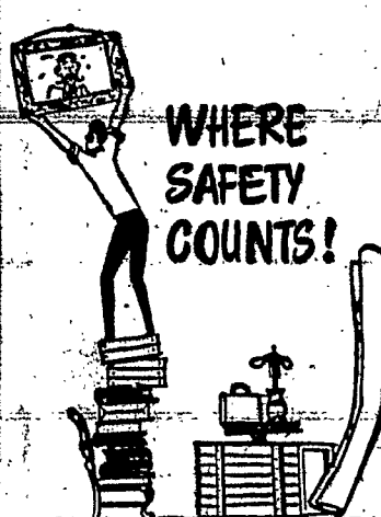
WHERE SAFETY COUNTS!

EMPLOYMENT SERVICE AND CONSULTANTS Men and Women Salary Accounting 30th Year Executive, Technical, Administrative, Clerical, Secretarial 0240 715 Sibley Tower Bldg.