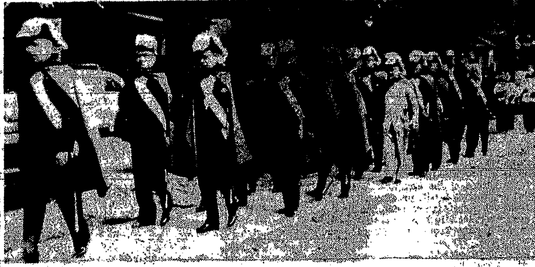
FOURTH DEGREE members of the Knights of Columbus are shown as they escort the Bishop from the rectory to the new St. Vincent de Paul Church, Corning. The knights also served as an honor guard for the Bishop during the special dedication service at the 11 a. m. Mass at St. Vincent de Paul's marking completion of the $85,000 building program of the parish. Other Photos on Page 1A.