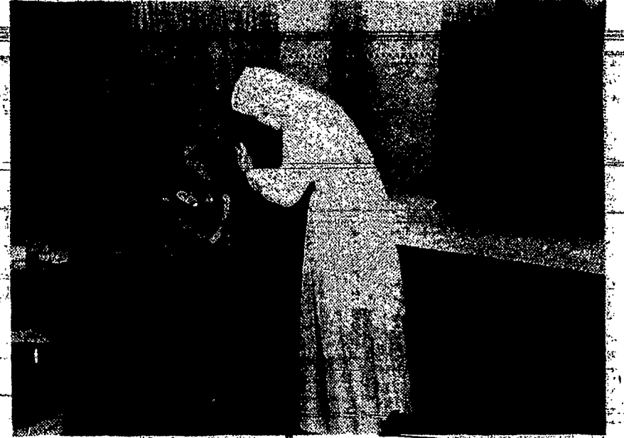
LIGHT ON THE SUBJECT — When a sore throat calls for professional help, Sister is there.