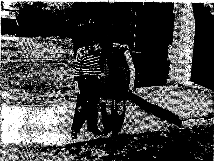
PALS AGAIN — I'm sorry that I gave you that black eye.