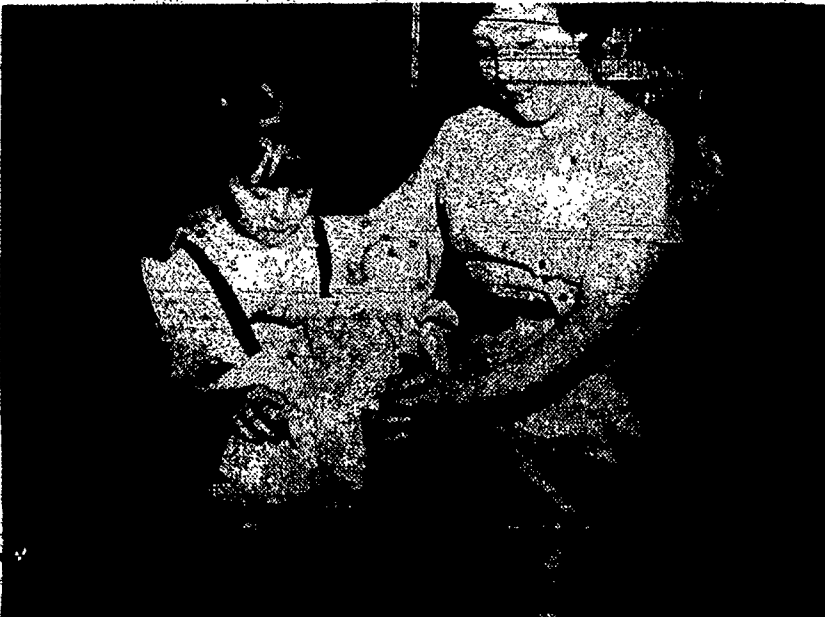
LIFE'S MINDS TRAGEDY — Don't cry, honey, maybe I can fix her for you.