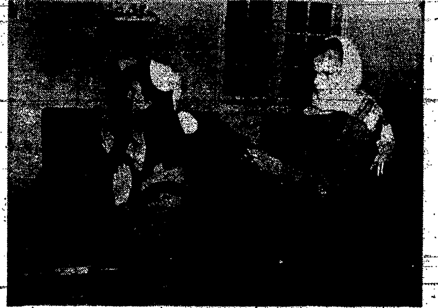
HOPE FOR THE WORLD — Children pray for themselves, their families, and for the world.