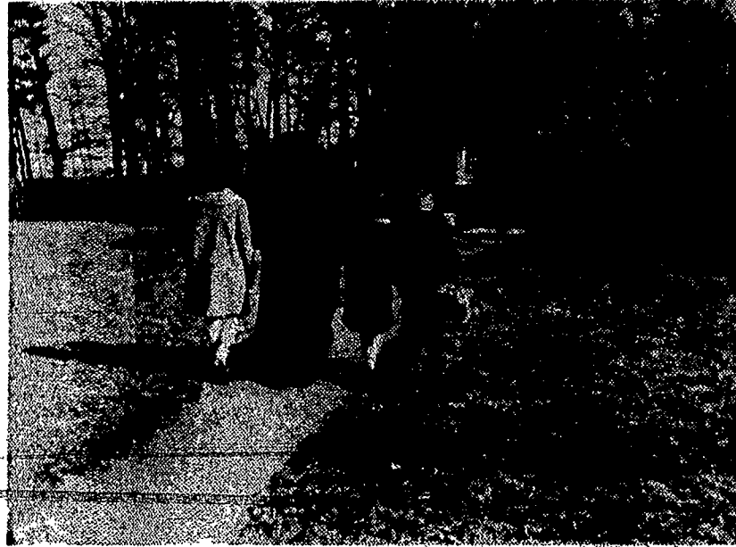
WALKING THE MARY WAY — The children like to pray at Our Lady's shrine.