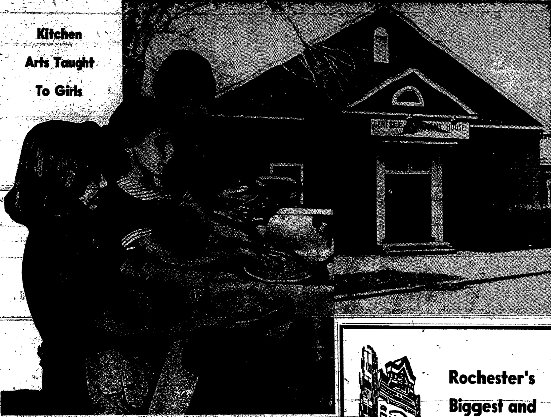
GENESEE CENTER—'Lino Women' learn home-making arts.