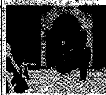
After a few moments of earnest conversation, she replaced the phone on its hook and marched triumphantly into the office.