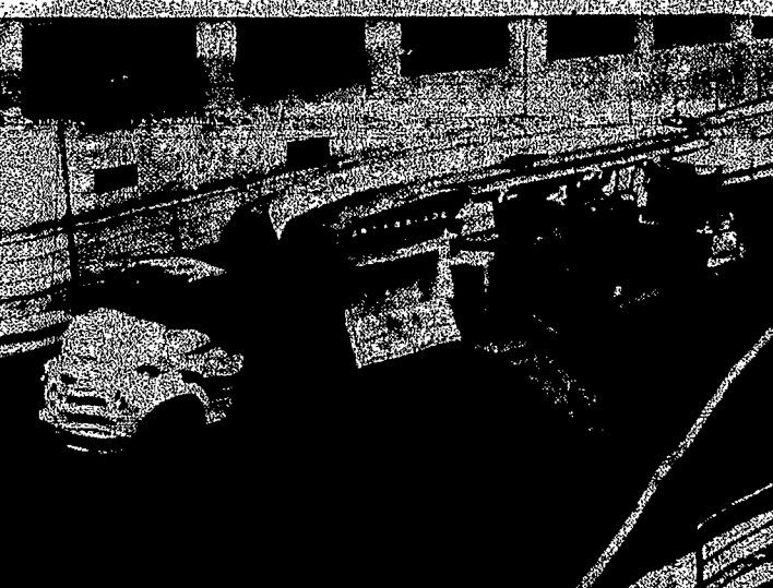
A view of the spectacular ANTHRACADE mobile heating unit and automatic hard coal equipment display which will appear at the Rochester Home Show, April 23-30, at Edgerton Park, through the sponsorship of the Rochester Coal Industry, Inc.