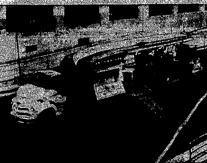
A view of the spectacular ANTHRACADE mobile heating unit and automatic hard coal equipment display which will appear at the Rochester Home Show, April 23-29, at Edgerton Park, through the sponsorship of the Rochester Coal Industry, Inc.