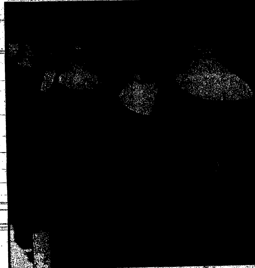
Novice wears holy habit for first time

WHEN A WHOLESOME normal American young woman wishes to be a Sister of Saint Joseph, she comes to their Motherhouse on East Avenue to enter the postulate. There she spends the first period of probation prescribed by the Holy Mother Church for those desiring to dedicate themselves to the service of God. This initial step continues from six to eight months, giving the aspirant the opportunity to become acquainted with the life of a Sister of Saint Joseph and to learn more specifically the meaning of the call to religion. It also enables her superiors to judge her adaptability to the new life. At this period of formation the postulant follows a well-balanced schedule of prayer, study, work and recreation.