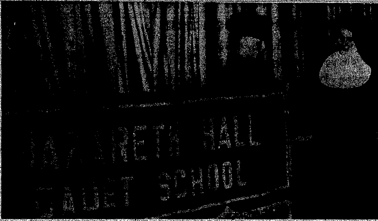
Sister of St. Joseph inspects Cadet School