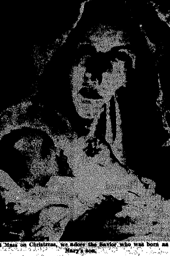
At Mass on Christmas, we adore the Savior who was born as Mary's son.

At the Offertory, we ourselves are the shepherds. In which we attend to a sharing in Mary's adoration. The Introit is God the Father's message to the new-born babe.