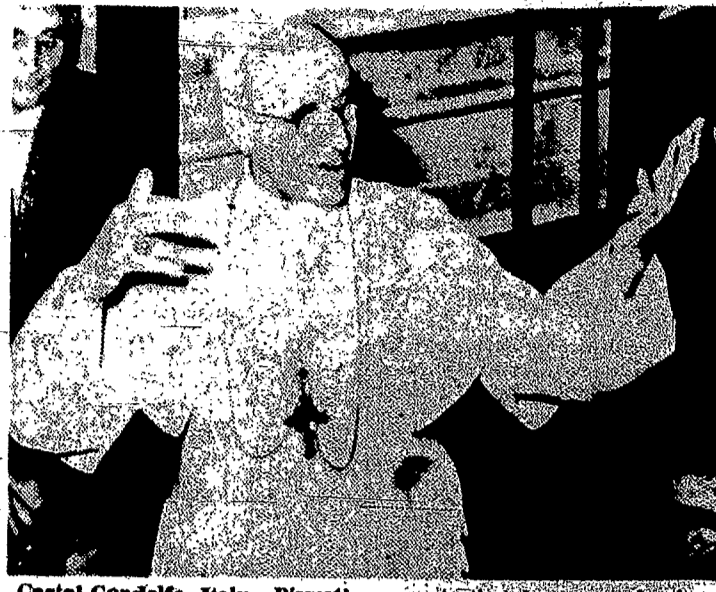
Castelgandolfo, Italy — Disputing reports that he was seriously ill again, a smiling Pope Pius XII waves from a courtyard balcony at his summer residence here to some 5,000 pilgrims received at a mass audience. The 78-year-old Pontiff, who had been ailing for several days, limited the audience to giving his paternal greeting and apostolic blessing. The Pope was said to be suffering from recurrent bouts of lightheadedness due to fatigue brought on by overwork. He has been urged by his personal physician to curtail his activity and receive only his closest associates. This the Pope has been reluctant to do.