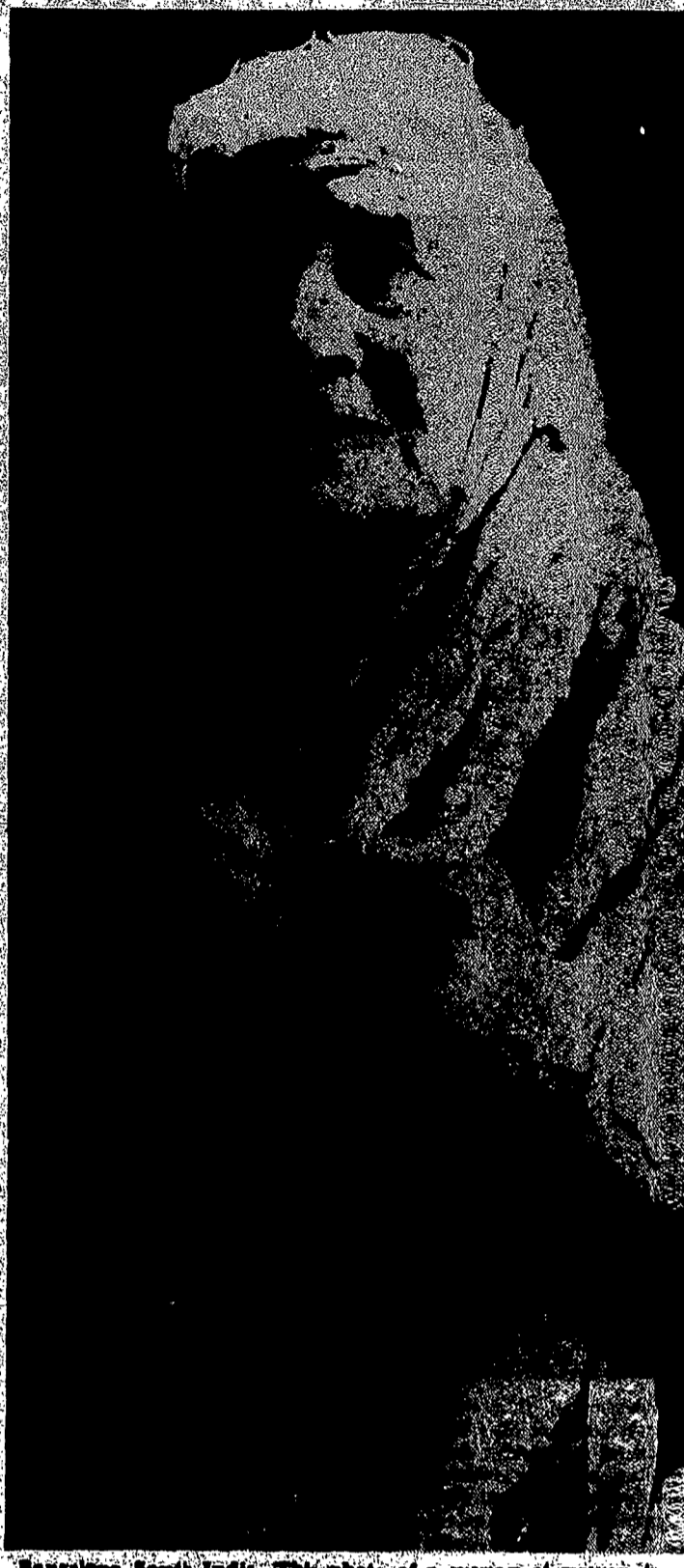
Maunglers, South India—This photo of a woman at prayer in a Catholic church here symbolizes the devotion to the Rosary held by millions of faithful throughout the world.