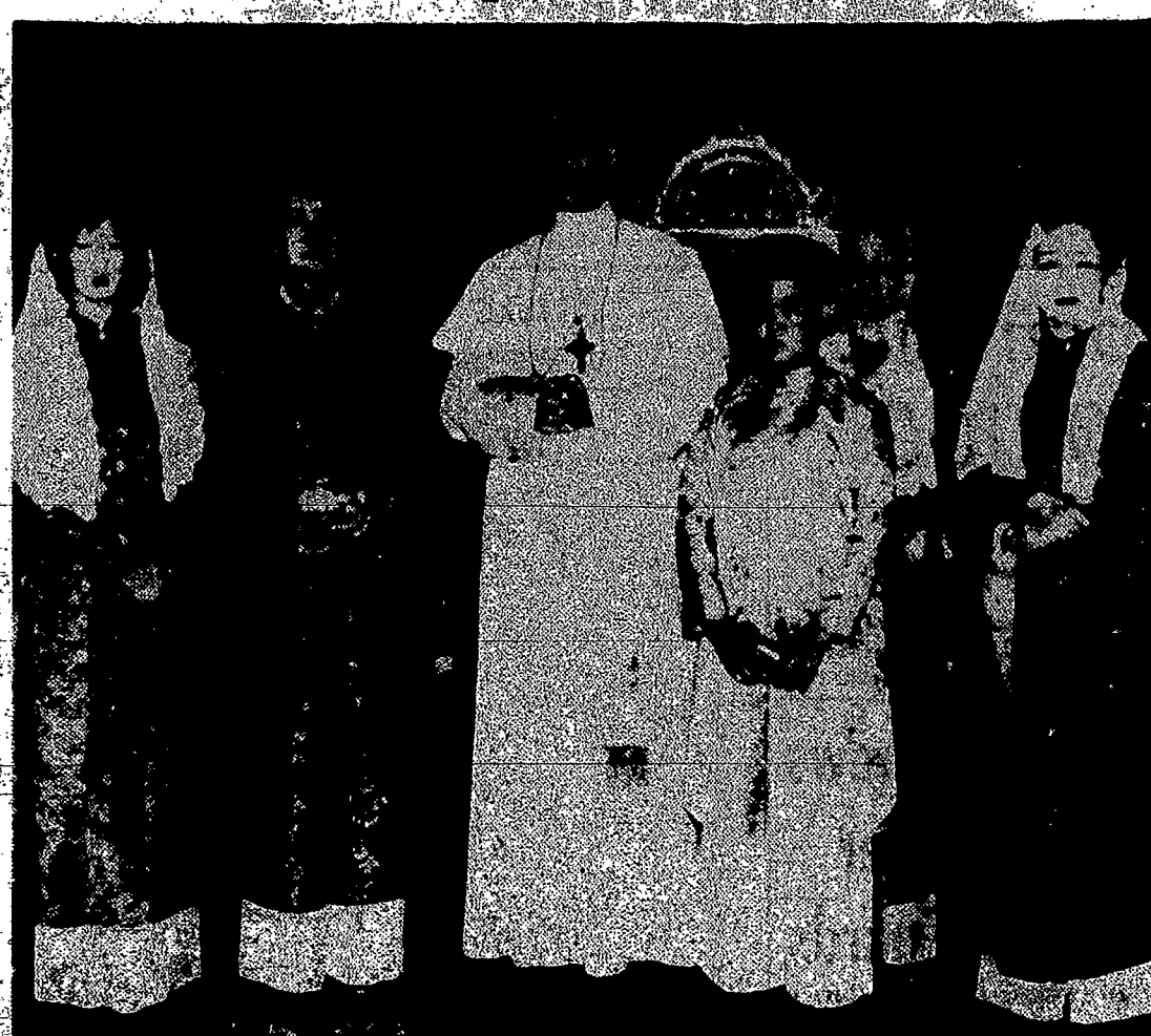
Vatican City—Empress Nam Phuong of Vietnam (near Pope on left) is shown with Pope Pius XII after a private audience. The Empress, a convert to Catholicism, is the wife of Emperor Bao Dai. Also in the photo are members of her family and personal aides.