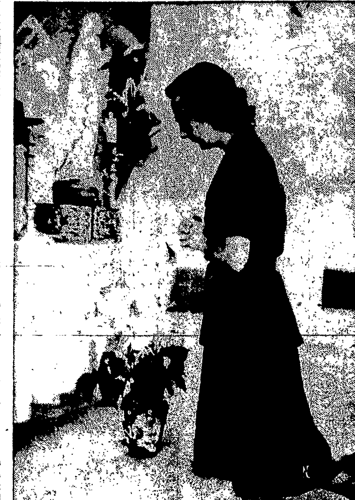
Miss Genevieve de Galard, heroine of Dien Bien Phu, is in the U.S. on invitation by a special Congressional resolution. She is pictured above on the day of her release by the Communists, praying in the chapel of the Lamassan Hospital, Hanoi. Lt. de Galard, a Catholic, was the only woman in the recently besieged Indo-Chinese garrison before and after its fall.