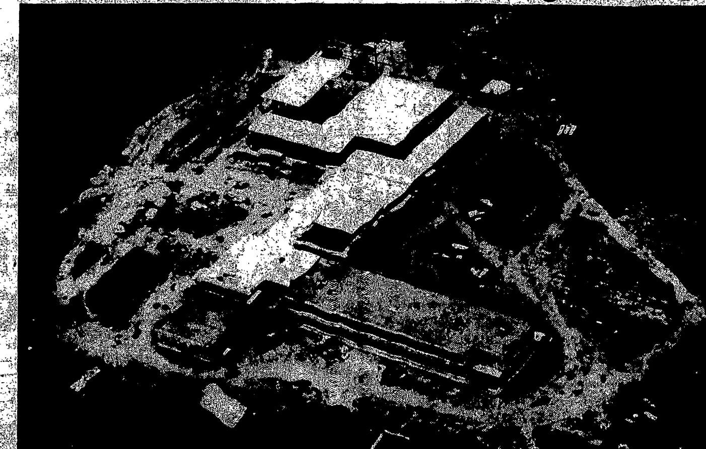
RAPIDLY TAKING shape on Lower Maple Ave., Elmira, is the new Notre Dame de Lourdes High School. Steel erection is completed and brick work is progressing rapidly. The gymnasium-auditorium unit at the left in the background.