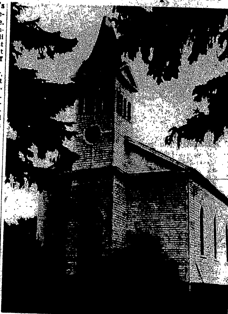
St. Feehan's Church on Chestnut Ridge Road in Chili will be the scene of priestly centennial rites in November. Formerly attached to a mission of St. Vincent de Paul's Church in Churchville, St. Feehan's was recently established as an independent parish and for the first time in a hundred years has a resident pastor.

THE COMING solemnities will mark the second time in recent years that the Salus Populi Romanus has been borne in procession from its special place of honor in St. Mary Major's. The last time was December 8, 1949, when Rome was preparing for the solemn opening of the 1950 Holy Year.