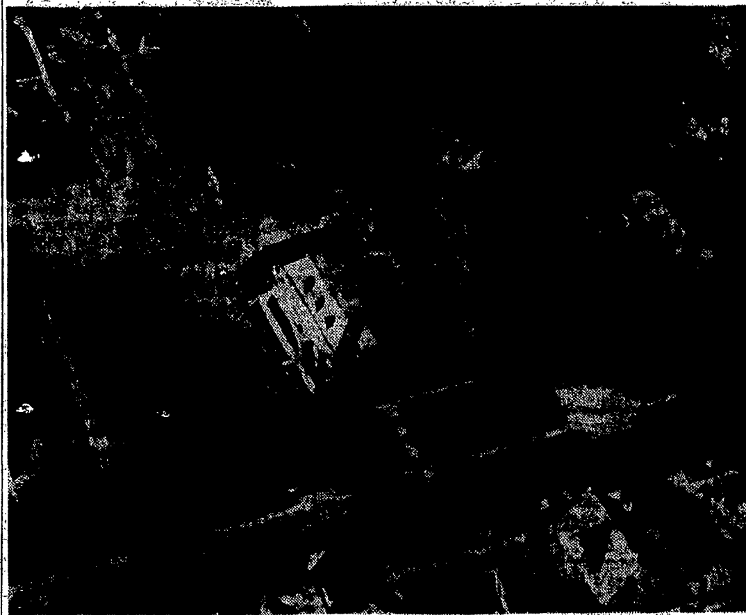
AIR VIEW of buildings comprising the modern plant of Our Lady of Perpetual Help parish. Church building (center) is flanked (left in photo) by the parish school and rectory and by the convent (right in photo).