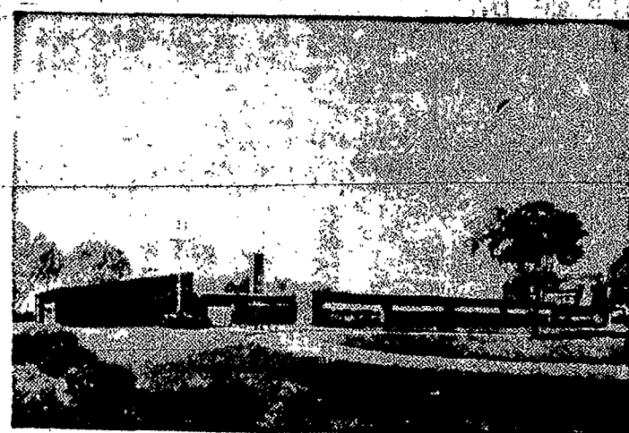
ARCHITECT'S SKETCH of proposed St. Rita's School, in West Webster, campaign for which is about to open.

There will be games followed by refreshments.