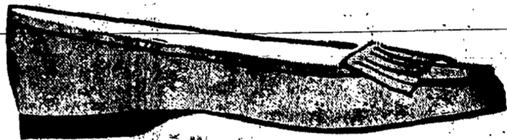
Purpose, happy-go-lucky flat, just 6.99