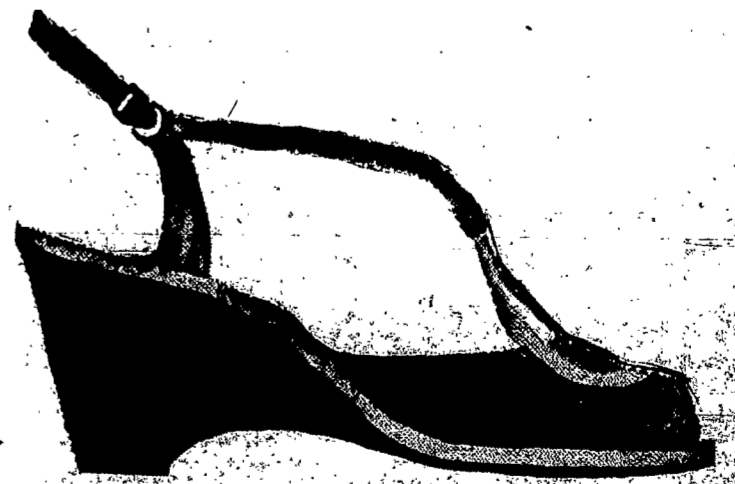
Too-Party, blissfully comfortable, 9.99