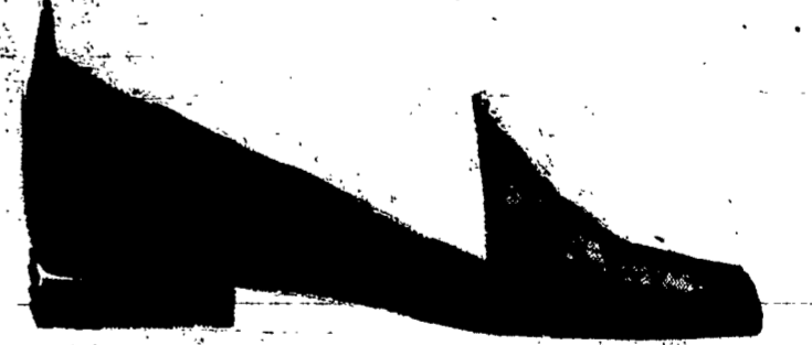
Leaflet, your beloved classic flat, 8.99