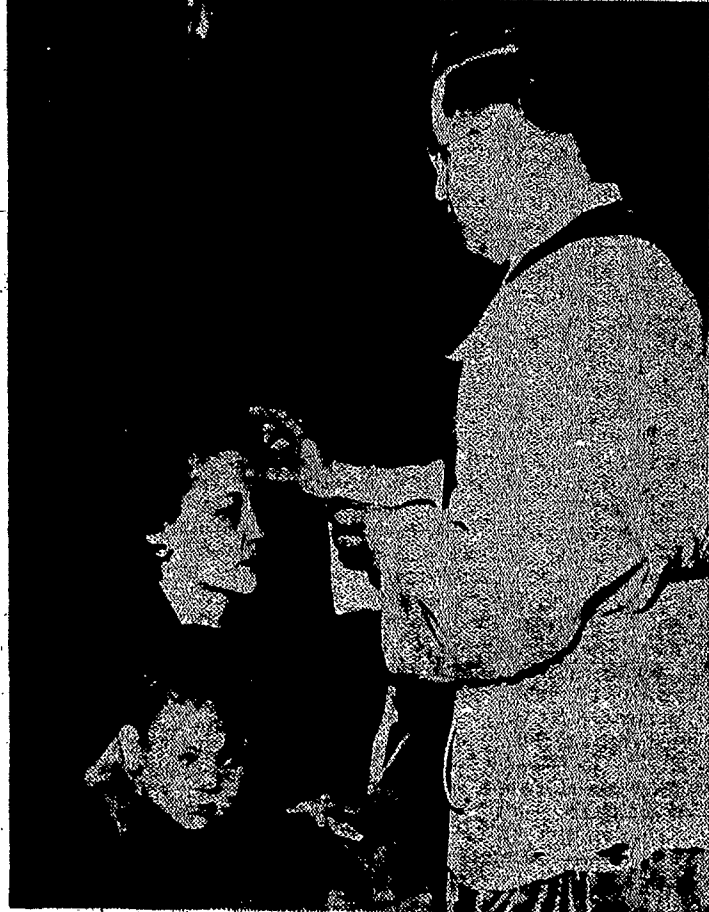
ASH WEDNESDAY, which heralds the beginning of the Lenten season, is the day when ashes are blessed and placed on the forehead of the faithful to remind them of their final end and the necessity of prayer and penance in reparation for the sins of the world. Photo shows a priest administering the ashes while he pronounces in Latin: "Remember, man, that thou art dust, and unto dust thou shalt return."