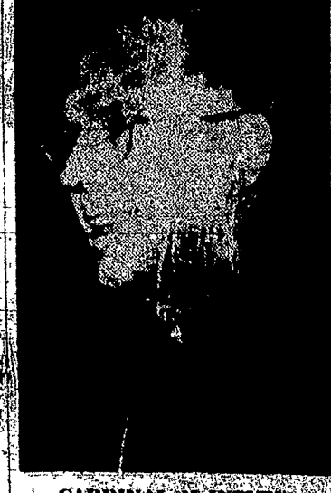
CARDINAL MCINTYRE 'Decency Offended'