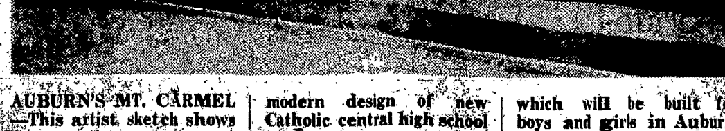
AUBURN'S MT. CARMEL — This artist sketch shows modern design of new Catholic central high school which will be built for boys and girls in Auburn. Starting date for construction will be next July 1. The school will be in charge of the Carmelite Fathers.