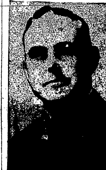
BISHOP SCULLY "Box Office Receipts"