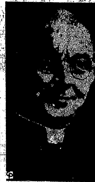
CARDINAL MCINTYRE "Request Refused"

Citizens of all faiths in Los Angeles have been asked by His Eminence James Francis Cardinal McIntyre, Archbishop of Los Angeles, to repudiate the film, "French Line," which offends "the traditional standards of any American community."