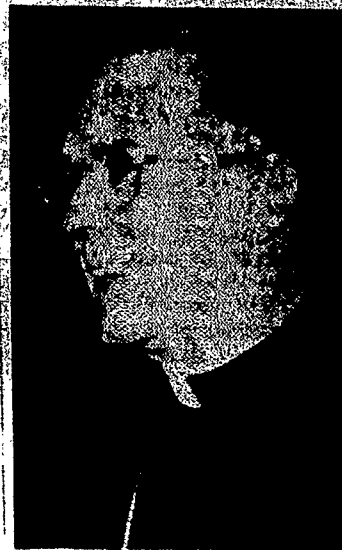
CARDINAL MCINTYRE "Decency Offended"

One report says that seven priests, now used for Red slave labor, were sent from their camp to cut wood in the Tatras mountains and never returned. They were reportedly swept to death by an avalanche.