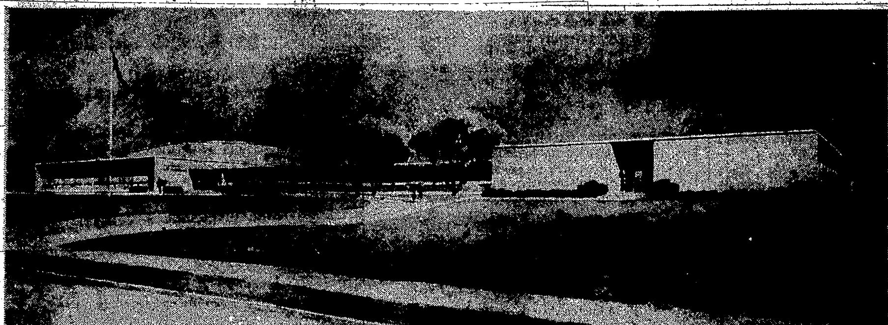
AUBURN'S MT. CARMEL