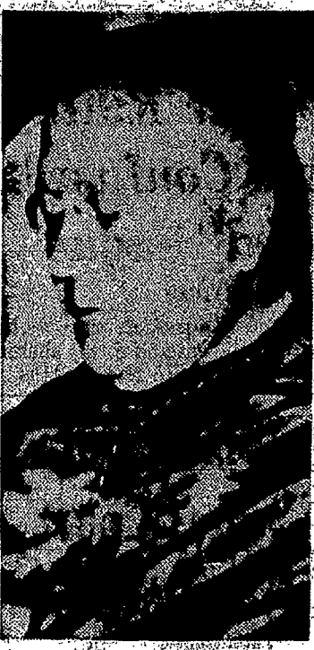
CARDINAL FELTIN "Remain disciplined..." In matters of doctrine by correcting errors, Catholics, he

THE CARDINAL asked his priests to meditate on the example of Father de Lubac, one of whose books was refused the approval of Catholic authorities. "Father de Lubac could have sulked," the Cardinal noted. "He could have kept silent. What did he do? He wrote an admirable book on Holy Mother Church."