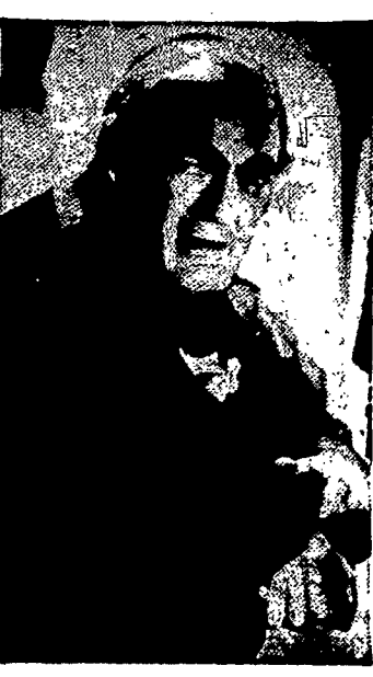
Lionel Barrymore, dean of drama will star in his 17th broadcast performance as Scrooge in Charles Dickens' "A Christmas Carol" on CBS Radio's Hallmark Radio Hall of Fame" Sunday, Dec. 28.