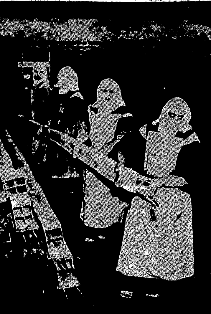
Turin, Italy—Four of 13 disheveled Carmelite nuns who are building the stone walls of their new enclosed convent near here are shown carrying heavy cement bases from their material dump to the convent grounds. A special Papal dispensation made it possible for the nuns to disrupt their normal daily prayer and meditation to carry on the construction work. After the convent is solemnly dedicated during the 1954 Marian year, the doors will be closed upon its 13 nuns who will return to the vigorous life of the enclosed community, one of the Catholic Church's most austere and withdrawn orders.