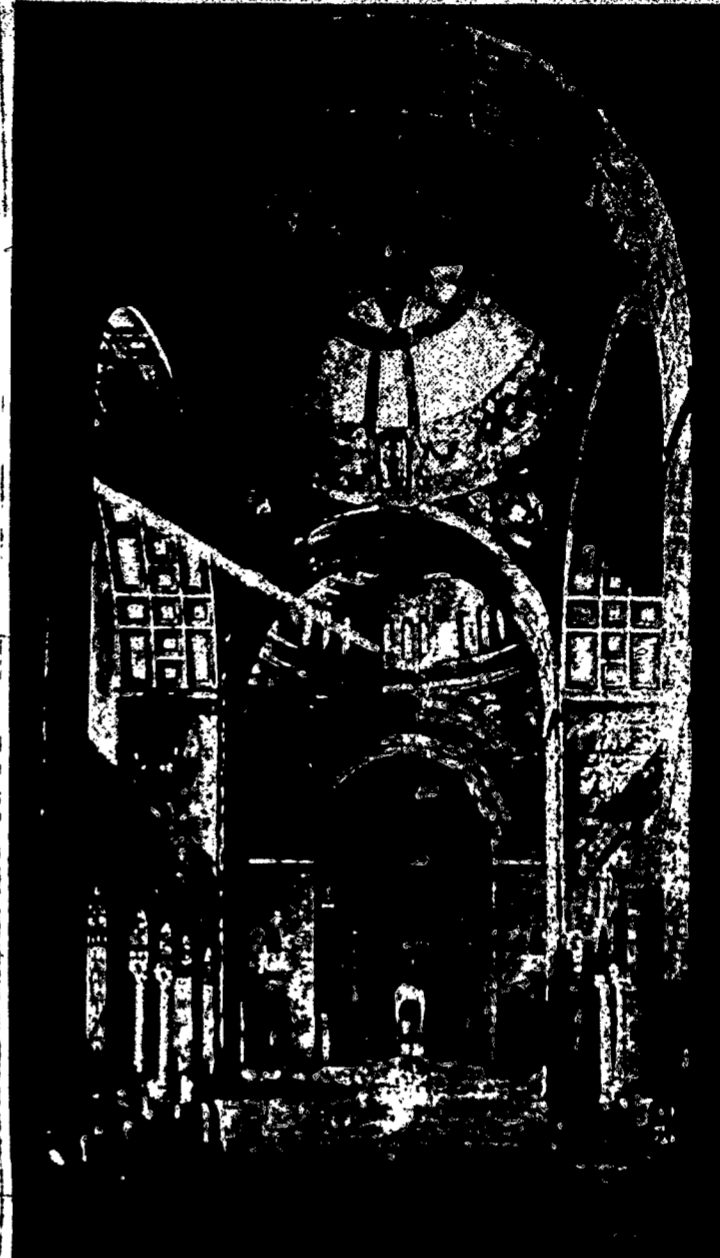
This is how the great church in Washington, D. C., dedicated to the Mother of God will look when completed. It is the National Shrine of the Immaculate Conception, and will be one of the ten greatest religious edifices of the world. The foundations, including a splendid Crypt Church, are completed. Final appeal for the Shrine will be held this Sunday (Nov. 29) in the Rochester Diocese.

Vatican City — (NC) — The true purpose of the Marian Year — to inspire men to holiness and to foster greater devotion to the Mother of God — will best be realized through demonstrations and observances in diocesan and parish level everywhere. This statement was contained in a letter sent to Cardinals throughout the world by Archbishop Luigi Traglia, Vicar of Rome, who has been named president of the committee set up by His Holiness Pope Pius XII for the observance of the Marian Year which begins December 8. Archbishop Traglia's letter said his committee was set up "not to promote or regulate a flow of pilgrims to the Holy City, as in