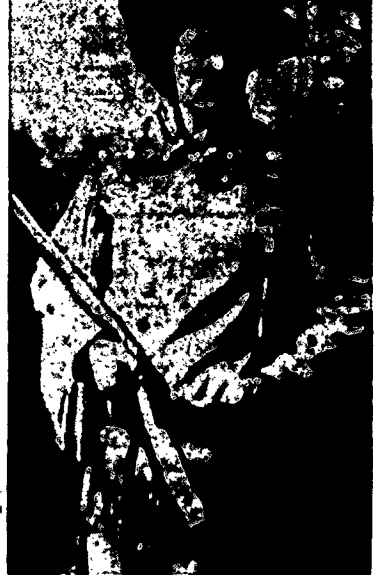
CHIEF CHEE DODGE

Though Chee Dodge in picture here from Ben Wittick Collection of the Library of Anthropology in Santa Fe, looks like Buffalo Bill than an Indian, he was the most distinguished chief in Navajo history. His life story reads like an Horatio Alger tale.