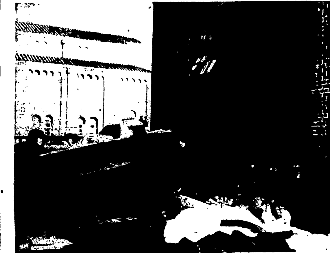
INSTALLING NEW BOILER In St. Joseph's Hospital, Elmira, workmen are shown casing the new 250 h.p. steam boiler into the boiler room. The new boiler, which will not be ready for operation until about Jan. 1, replaces two 30-year-old boilers. It can be fired with either coal or gas. In the meantime the hospital will use another boiler until the new one is ready to be fired up.

CORPUS CHRISTI 100 Main Street East PASTOR — RT. REV. MSGR. WILLIAM M. HART, V.G., P.A. MASSES — SUNDAY 7, 8, 9, 10, 11, 12:15