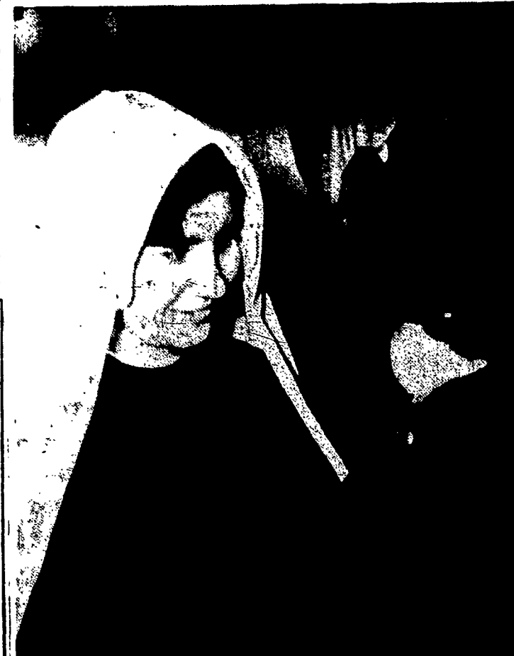
Quebec —Dressed in her new religious garb, 19-year-old Marie Dionne, last born of the famous Dionne quintuplets, bids farewell to her mother at the convent here of the Servants of the Most Blessed Sacrament where she has become a postulant in that cloistered order of nuns. For the first six months, Marie will be a postulant after which she will take temporary vows and become a novice for two years. Following this, for three years she will make annual professions of the vows of poverty, chastity and obedience before taking her final vows to devote the rest of her life to the order. Marie said the life of a nun would give her an opportunity to repay the many thousands who prayed for her during her first week of life when she was struggling for survival.