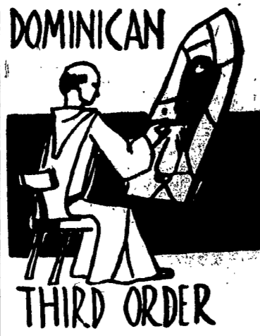
DOMINICAN THIRD ORDER