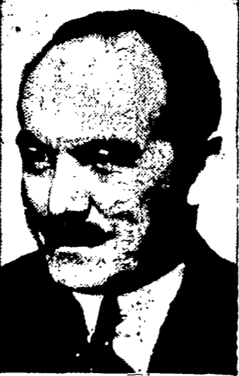
DR. CARLOS DAVILA, second speaker in the Thomas More Lecture Forum will be heard at the Rochester Chamber of Commerce on Tuesday, Nov. 10 at 8:15 p.m. His topic will be "Can We Have a Better Good Neighbor Policy." He is a former President of Chile and Ambassador to the United States.