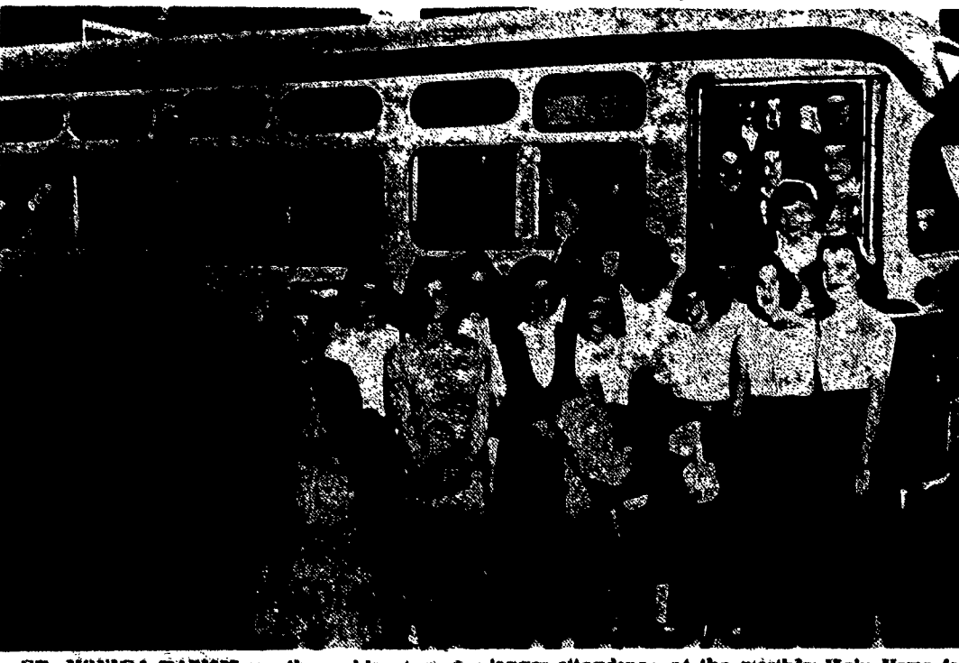
ST. MONICA PARISH youth seeking to get a larger attendance at the monthly Holy Hour for youth held at St. Joseph Church, chartered a bus last Sunday for 75 teenagers to attend the services attracting young people from all over the city. The St. Monica project was in charge of the Sociality and Catholic Action groups. A large number is expected next month.