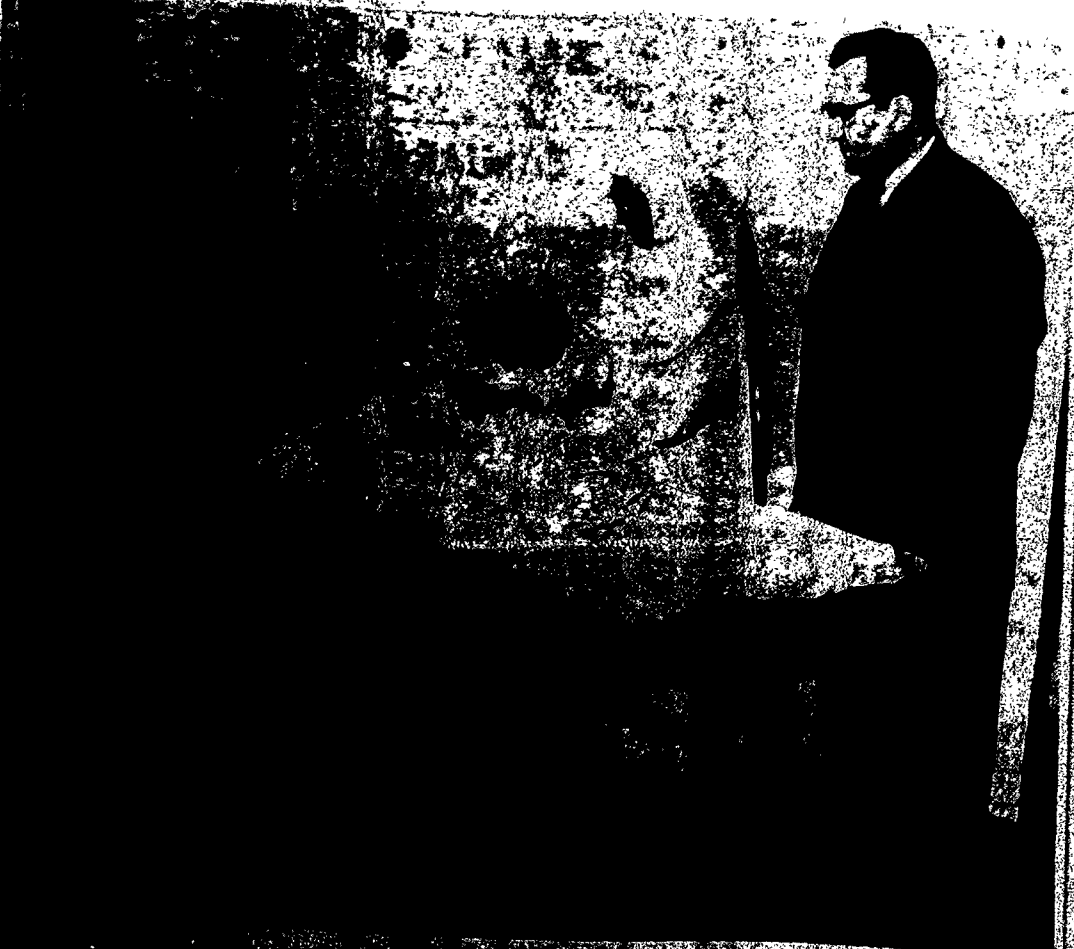
Gifts presented to the business community by the Chamber of Commerce are being tried out by the members of the Chamber of Commerce. The gifts are being distributed to the members of the Chamber of Commerce. The gifts are being distributed to the members of the Chamber of Commerce.