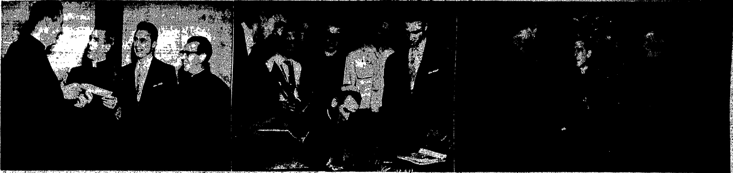
MISSIONED MINDS: Aquinas Institute students make a report to the national director of the Society of the Propagation of the Faith, His Excellency Bishop Fulton J. Sheen on his visit to the school, Thursday, June 1. In first photo, check for $2,000 is