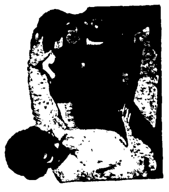
Rochester Orthopedic Center