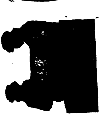
Rochester Council of Girl Scouts