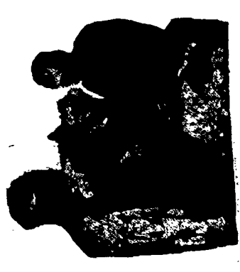
Highland Hospital of Rochester

SHOW HOW MUCH YOU CARE! ROCHESTER COMMUNITY CHEST 1953