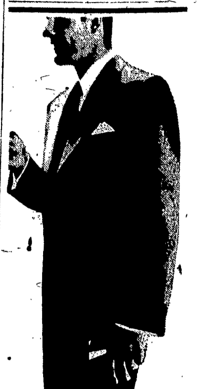
Miron's COURIER CLOTH Rochester tailored exclusively by Michaels-Stern