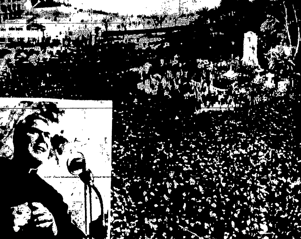
Malaga, Spain.—(RNS)—Photo shows part of the huge crowd, estimated at more than 100,000, that gathered here for ceremonies climaxing the first Family Rosary Crusade on the European continent.