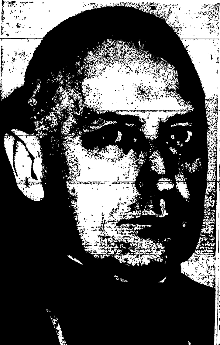
CARDINAL MINDSZENTY 'Devil servants of an evil power doomed themselves.'