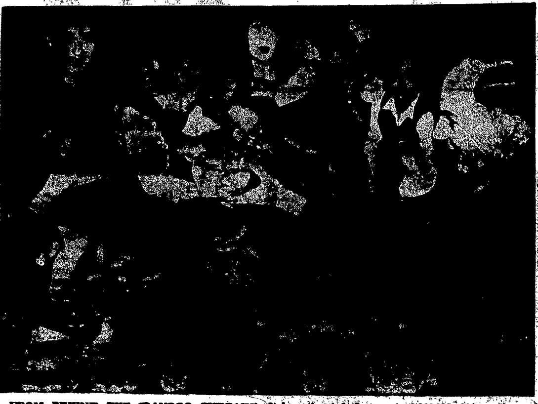
FROM BEHIND THE "BAMBOO CURTAIN"-It is collimated that some 3,000,000 Change have field from Red China. They must be housed, fed and clothed. Many need models attention. In your charity, give all you can now to the U.S. Richege' 1983 Appeal for the Victime of War in Europe, Asis, the Near and Far East, Catholics in most discusses of the United States will be asked to contribute to this fund on Lastare Sunday, March 15.

Scheduled to sail on the Inde Her present aursing school teen has held the championship to New York on the Constitution pendence on July 28 and return on September 9. the neur will events. Louis from Catholic, Protestant also provide for members of the four will moving and Jowish hespitals. perty who choose to fly.