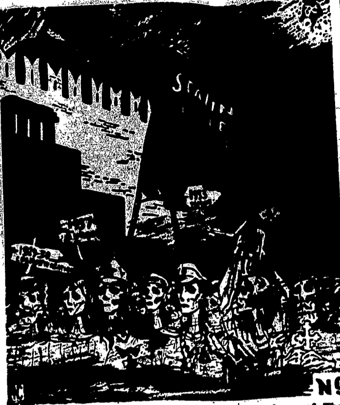
This striking cover design features the current issue of the Challenge bulletin of the Association of Political Prisoners of Soviet Labor Camps, Inc., New York 19, N. Y., which is doing remarkable work in broadcasting the truth about Communism as experienced by former Soviet citizens.