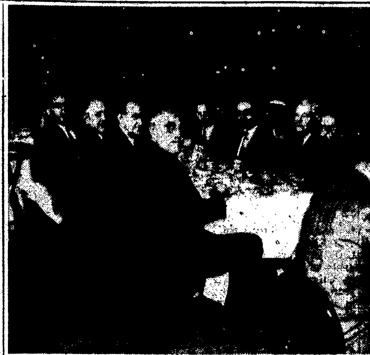
ELMIRA CAMPAIGN—Elmirans 800 strong swelled the Mark Twain Hotel on Wednesday evening for the kickoff dinner of the campaign which will raise $512,000 for the new Notre Dame