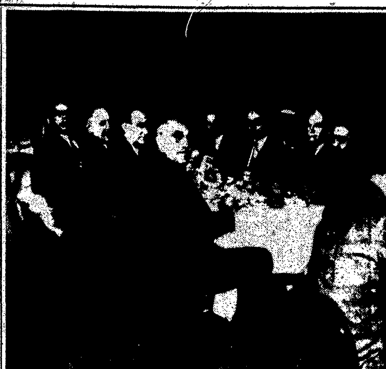
ELMIRA CAMPAIGN—Elmirans 500 strong swelled the Mark Twain Hotel on Wednesday evening for the kickoff dinner of the campaign which will raise $512,000 for the new Notre Dame