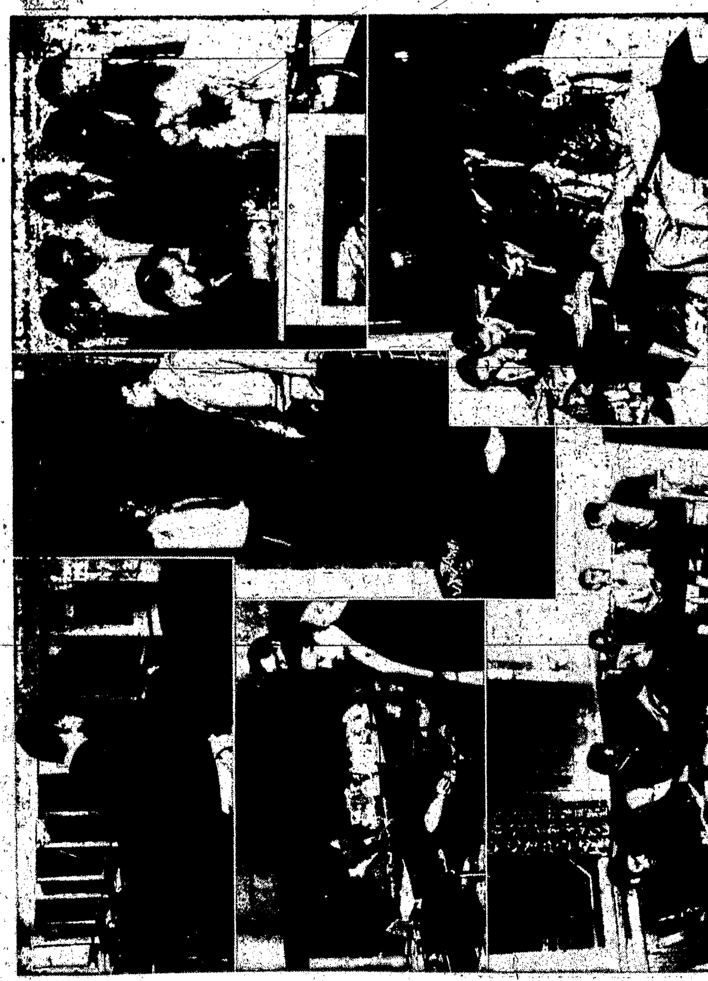
COLLEGE LIFE IN FULL SWING is shown in these familiar scenes taken at St. John Fisher. Photo (top left) shows student at work in laboratory. Modern elevator (top center) caters students to classes. The college Chess Club (top right) becomes an established student interest. Student appetites are satisfied in the college's cafeteria (left center). Most popular with Fisher-men is the Student Lounge (lower left). Classroom picture (lower right) shows the Class of '55 too busy with their books to look at the cameraman.