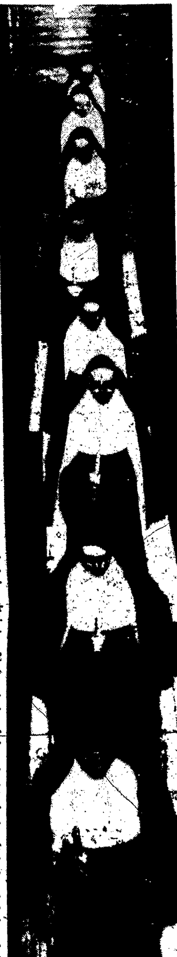
Mercy Sisters leaving Motherhouse Chapel after pledging first temporary vows in religion and receiving the black veil denoting their status as professed nuns. Other photo on page 7.

Martinsburg, W. Va. (RNS) — A dispute over the use of federal money for a hospital which a Roman Catholic order will operate is delaying completion of the new King's Daughters Hospital here.