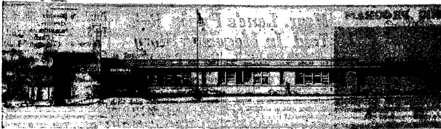
Architect's sketch of New School planned by Mother Of Sorrows Parish.