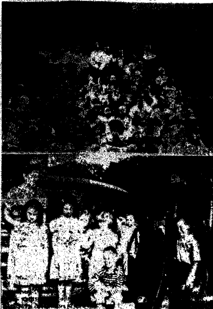
PUBLIC SCHOOL CHILDREN in Ithaca area receive religious instruction during the summer at Immaculate Conception School. Top photo shows some of the children with their teachers, the Mission Helpers of the Sacred Heart. A group of youngsters arriving at the vacation school is shown in the lower photo.