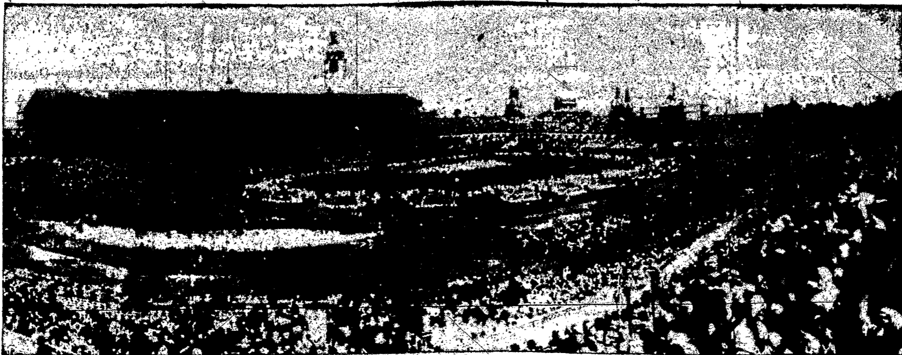
Some 500,000 of the faithful, including many American pilgrims witnessed ceremonies of the 35th International Eucharistic Congress, at Barcelona, Spain, May 27-June 1. Perhaps the most memorable event of the Congress was the mass ordination of 819 deacons in the huge Montjuich Stadium, pictured above. Twenty-one bishops from 9 countries were the ordaining prelates. It was the first world-wide Eucharistic Congress since the one at Budapest, in 1938.