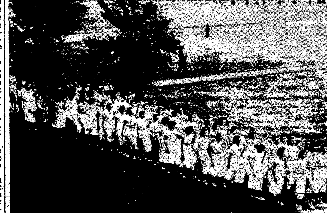
TRADITIONAL DAISY CHAIN procession on way to Nararoth College auditorium for Class Day exercises was one of the features of the